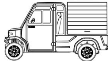
Box van with roller shutter doors