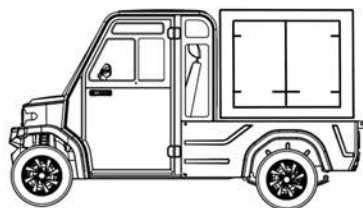
Box van body with insulated box