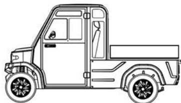
Pick up bed

Despite its compact size, it delivers exceptional performance and reliability unmatched by comparable vehicles. Discover the optimal configuration from our range to perfectly match your requirements!