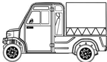
Mesh cage body with tarpaulin cover